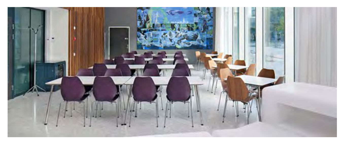
The canteen at St Olav's knowledge center.